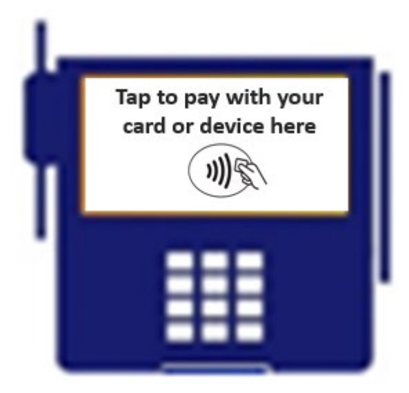
Figure 5–1: Device Illustration with EMV Contactless Symbol

Certain regions have specific user interface requirements; contact your Visa representative to confirm local or regional requirements.